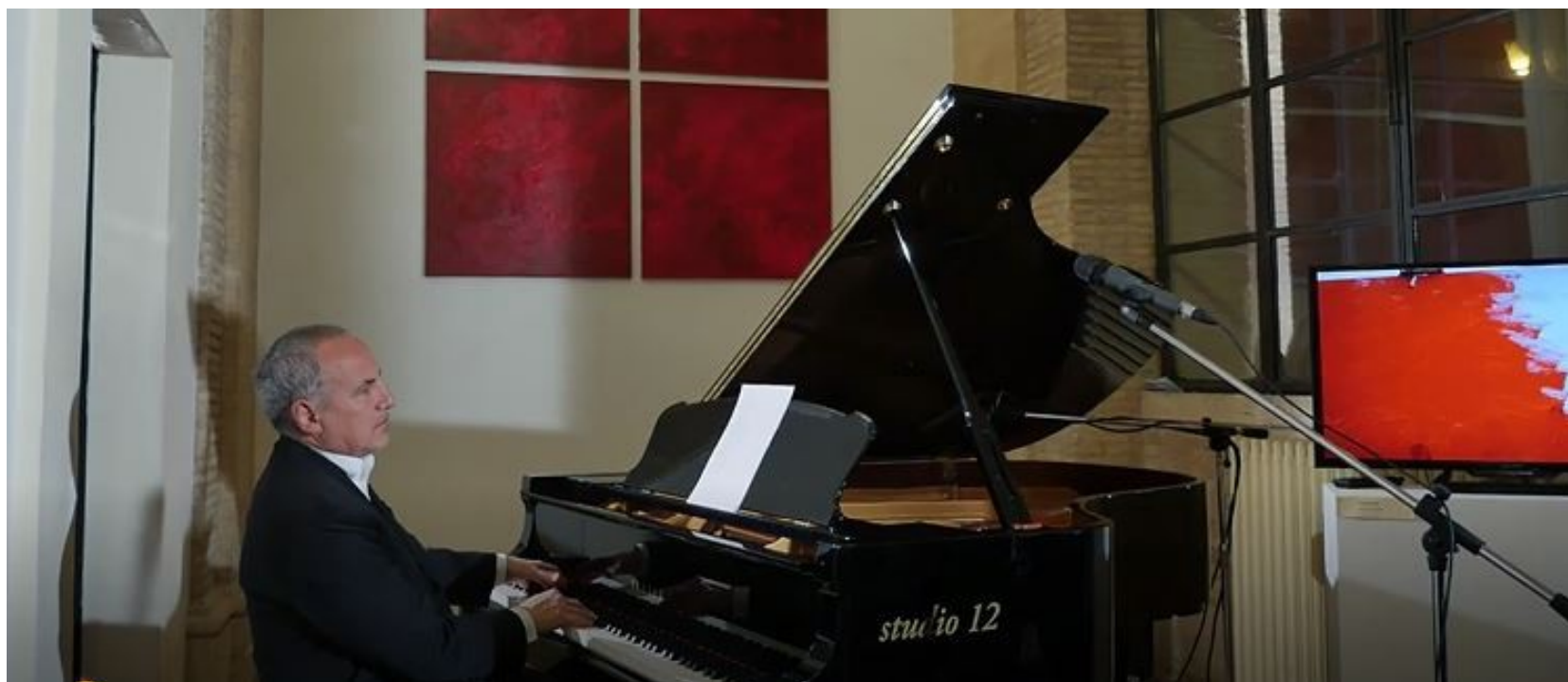
Performance of the pianist Danilo Rea on the occasion of the inauguration of "Dangerous Red"